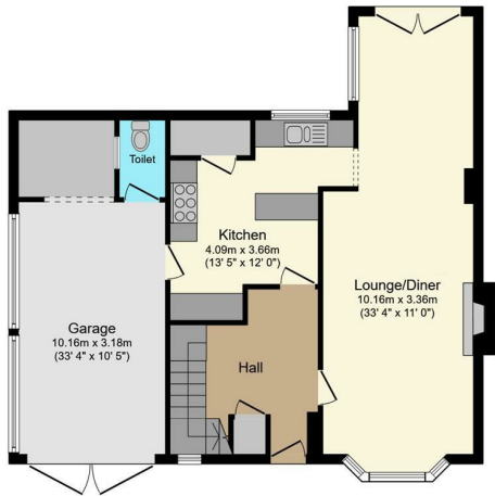
Ground Floor Floor area 82.2 sq.m. (884 sq.ft.)